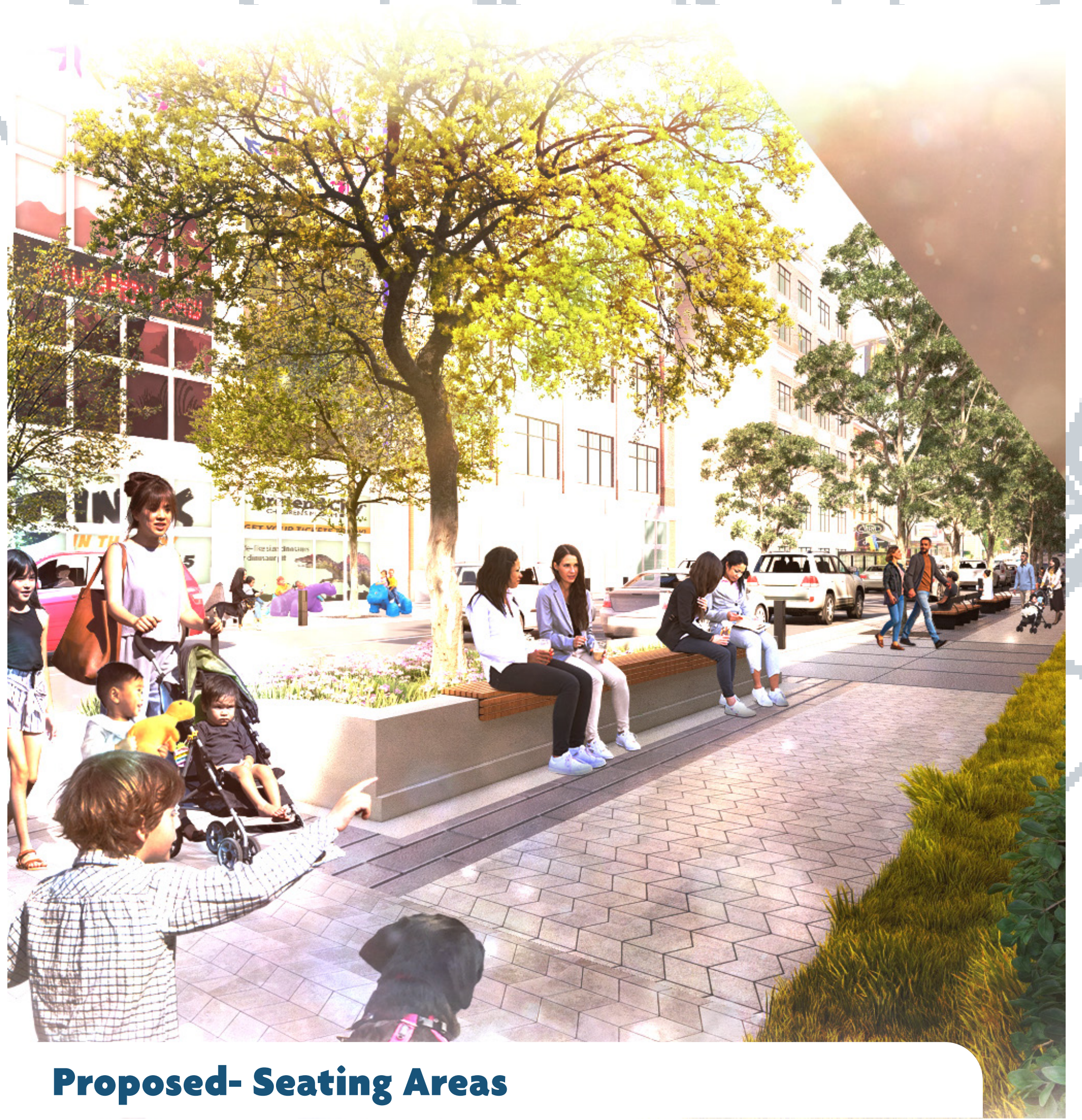
Proposed- Seating Areas