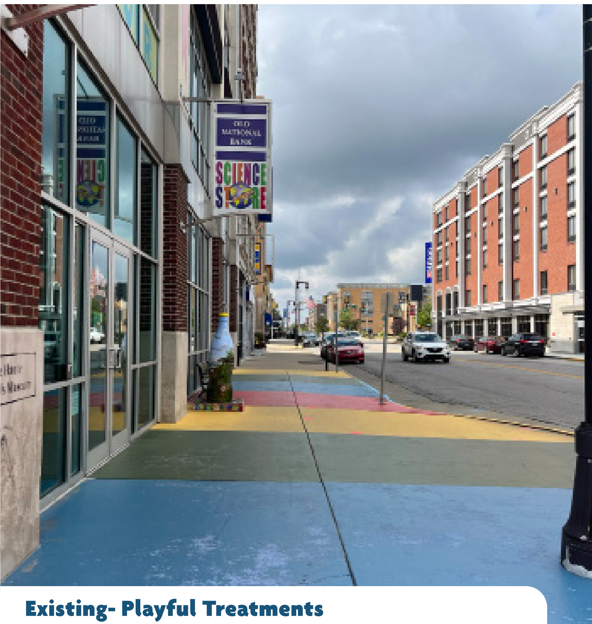
Existing- Playful Treatments