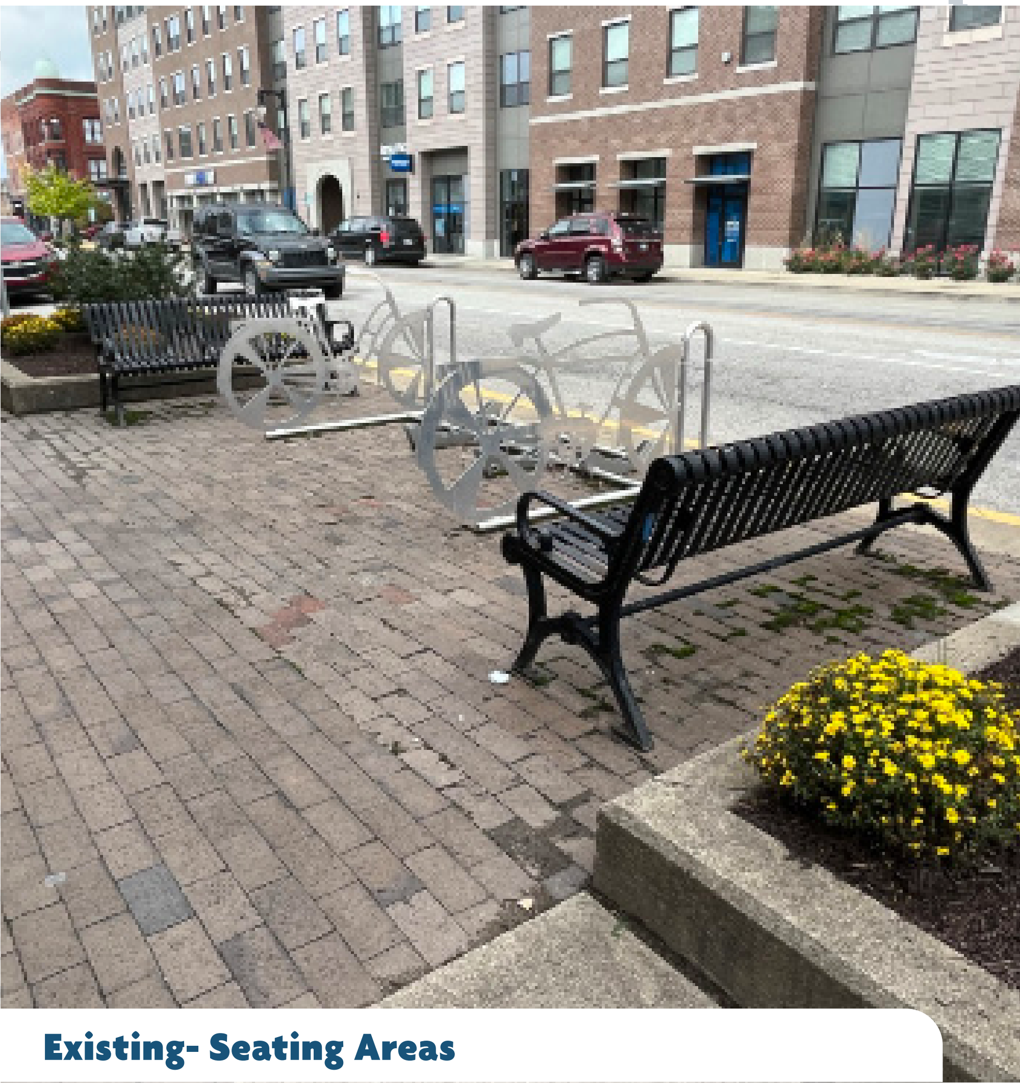
Existing- Seating Areas