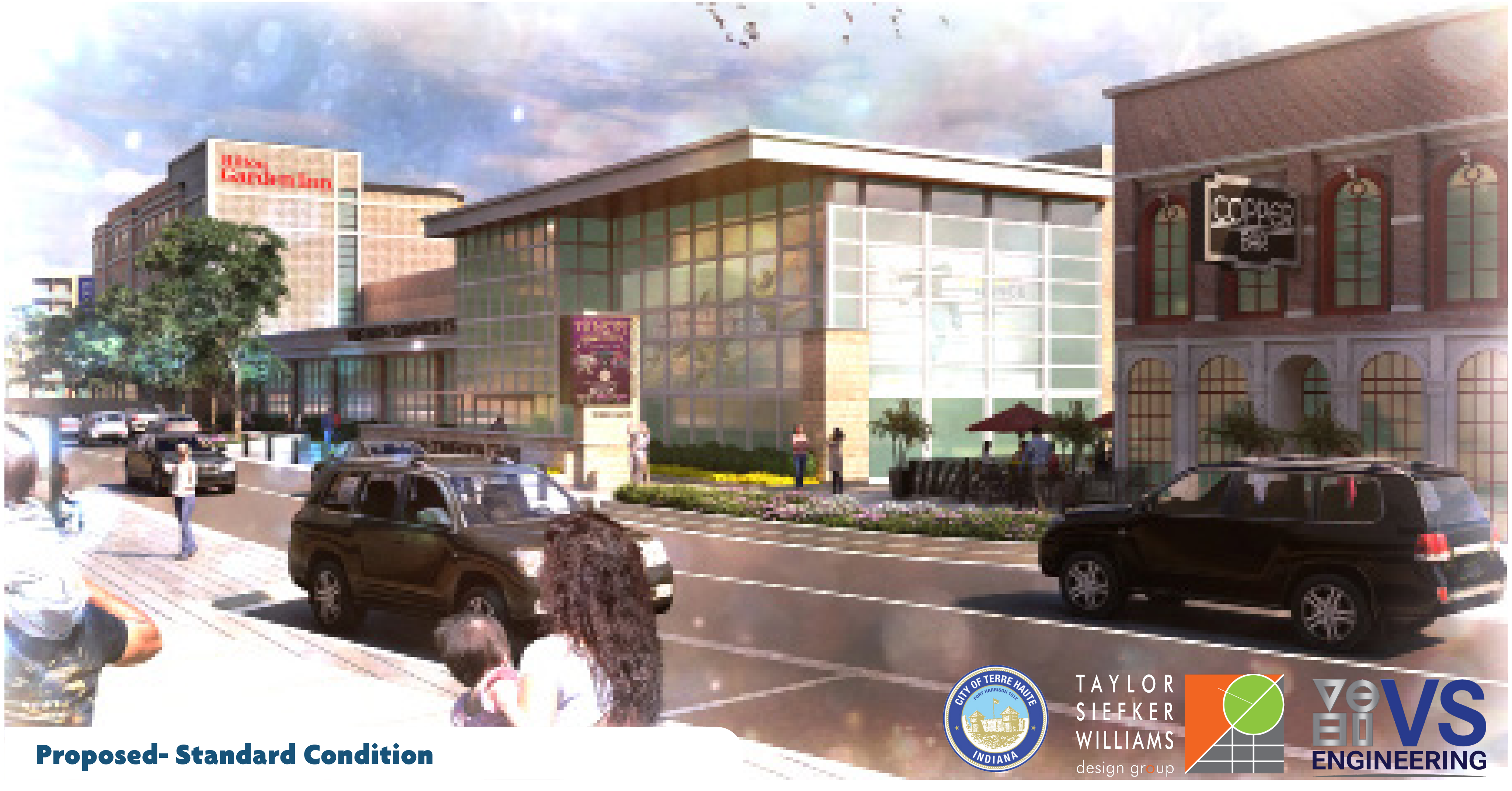
Proposed- Standard Condition