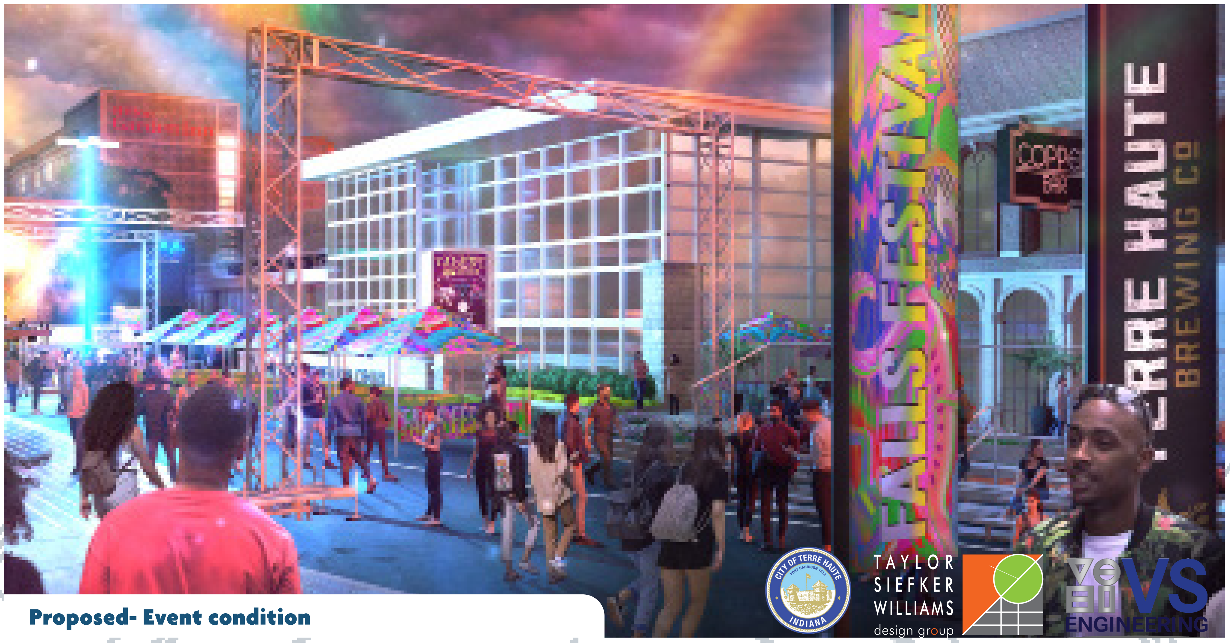
Proposed- Event condition