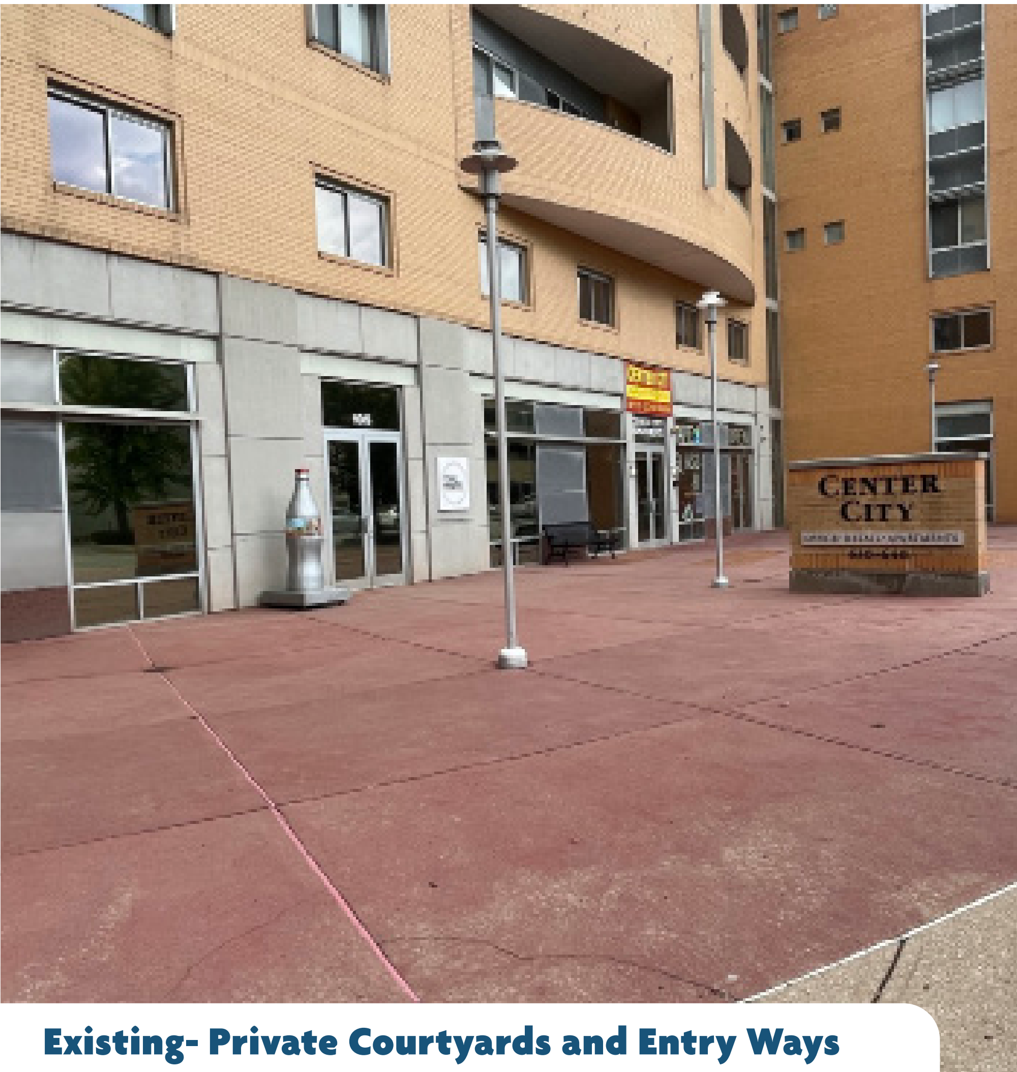
Existing- Private Courtyards and Entry Ways