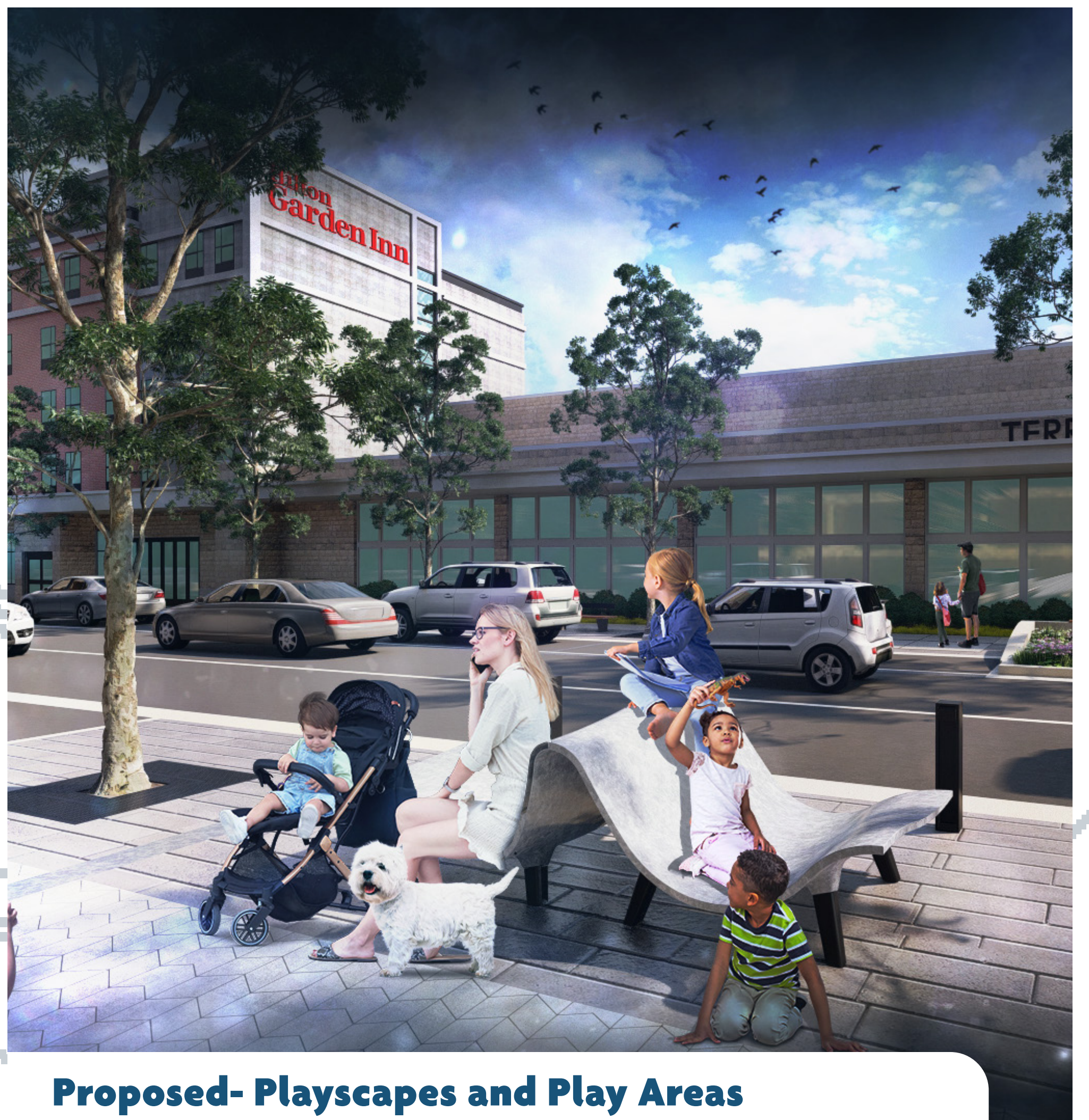
Proposed- Playscapes and Play Areas